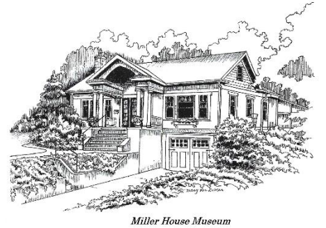
Miller House Museum

Publication of the Madeira Historical Society August - September 2025 madeirahistoricalsociety.org 513-561-9069