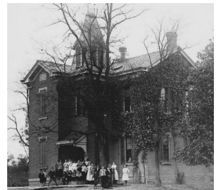
School House in 1910