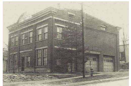
Traction Depot on Miami

He is a responsible business man, and Superintendent of the great Warner Elevator Company. He is a property owner and resides on Miami Avenue near the Traction Depot. His faith in our Town is shown by his recent purchase of additional property.