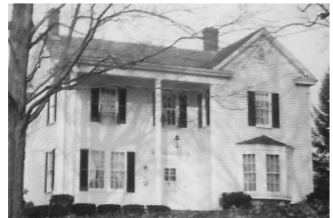
Druce home on Euclid