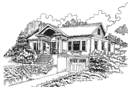
Miller House Museum

Publication of the Madeira Historical Society January 2025 madeirahistoricalsociety.org 513-561-9069