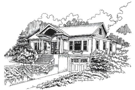
Miller House Museum

Publication of the Madeira Historical Society February 2024 madeirahistoricalsociety.org 513-561-9069