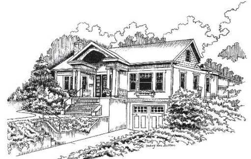
Miller House Museum

Publication of the Madeira Historical Society February 2023 madeirahistoricalsociety.org 513-561-9069