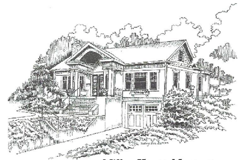
Miller House Museum

February 2023 – A message from your Madeira Historical Society President