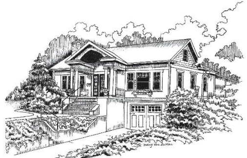
Miller House Museum

Publication of the Madeira Historical Society October 2021 madeirahistoricalsociety.org 513-561-9069