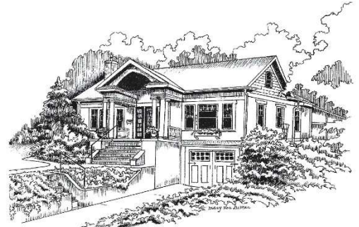
Miller House Museum

Publication of the Madeira Historical Society July 2021 madeirahistoricalsociety.org 513-561-9069